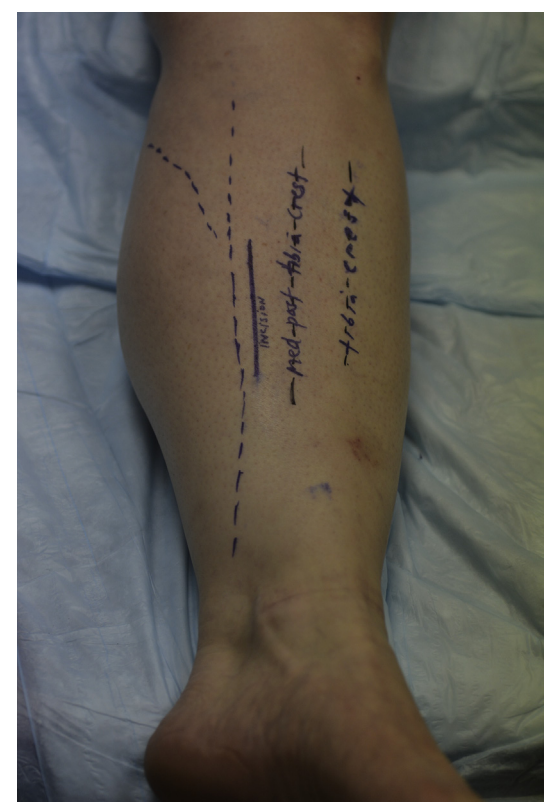
Fig. 13. Superficial and deep posterior fascial compartment incision. Dotted lines indicate fasciotomy: superficial posterior compartment fascia is cut proximally diagonally across or along the medial head of the gastrocnemius. Deep posterior compartment fascia is cut proximally toward the tibial crest and distally toward the posterior aspect of the medial malleolus.

Fig. 12. Completed anterior and lateral fasciotomy.