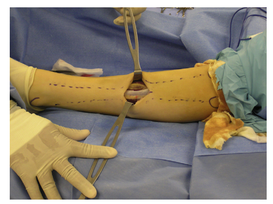
Fig. 12. Completed anterior and lateral fasciotomy.