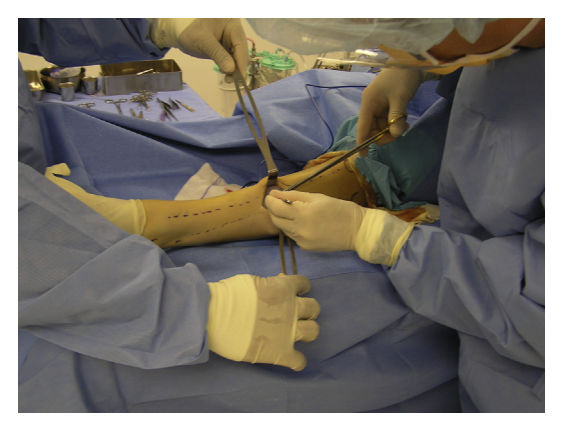
Fig. 11. Performing fasciotomy with 10-inch to 12-inch Metzenbaum scissor.

To release the fascia encasing the deep posterior compartment, make a nick in the fascia, and slide the scissors proximally in a linear longitudinal manner aiming the scissor tips proximally, straight upward toward the tibial crest staying anterior to the intermuscular septum and then distally downward staying posterior to the medial malleolus (see Fig. 13). Be sure to retract the saphenous nerve and vein anteriorly during the proximal cut. While releasing the deep posterior compartment, it may be necessary to release the "soleus bridge," which is a connection of the soleus muscle via soft tissue to the