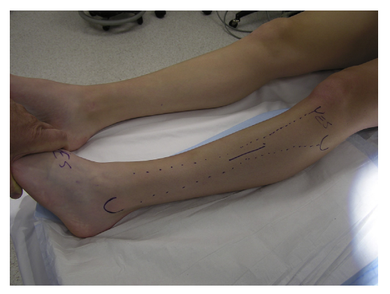
Fig. 7. Anterior and lateral fascial compartment incision. Dotted lines indicate fasciotomy: anterior compartment fascia is cut proximally toward patella tubercle and distally toward anterior aspect of lateral malleolus. Lateral compartment fascia is cut proximally toward fibular head and distally toward posterior aspect of lateral malleolus.

The anterior compartment will lie anterior to the intermuscular septum. Make a nick with a scalpel blade into the overlying fascia. Using a 10-inch to 12-inch Metzenbaum straight scissor, cut the overlying anterior fascia proximally toward the patella tubercle and distally toward the anterior aspect of the lateral malleolus (see Fig. 7). This cut is made by using the sharp portion of the scissors distally, holding the scissors open 1 cm and sliding the scissors along the fascia to cut it much like a tape cutter is used to remove athletic tape.