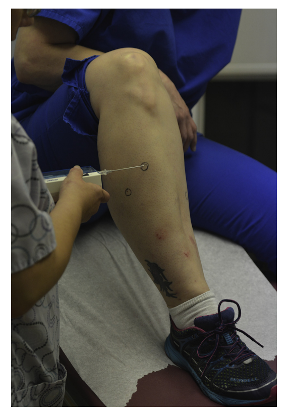
Fig. 3. Anterior compartment testing.

the needle perpendicular into the peroneus longus muscle belly in similar fashion as previously described. After the saline injection, record the pressure.