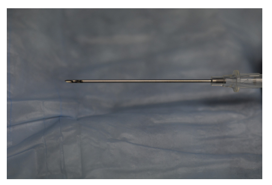
Fig. 2. Side-port needle.

Repeat the procedure for the lateral compartment (Fig. 4), which should be lateral to the anterior compartment and over the area of the fibular shaft. Here, you are inserting