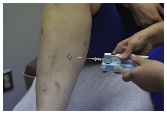
Fig. 5. Deep posterior compartment testing.

A timer is used to wait 5 minutes and then all 4 compartments are once again injected with the saline and the pressures again recorded in the same order as previously.