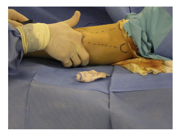
Fig. 8. Finger sweep dissection.

Release of the lateral compartment is performed after a nick is made in the fascia, lateral/posterior to the superficial peroneal nerve. The scissors are directed proximally toward the fibular head and distally toward the posterior aspect of the lateral malleolus (see Fig. 7). It is important to visualize and slide the tips of the scissors so that only the fascia is released and one stays posterior to the superficial peroneal nerve. By keeping the tips of the scissors along the fascia, one also avoids cutting the superficial branches of the peroneal nerve. While cutting the fascia, a slight upward pressure should be maintained to avoid cutting muscle tissue, which causes bleeding, and is also why blunt-tipped scissors are appropriate (Figs. 11 and 12).