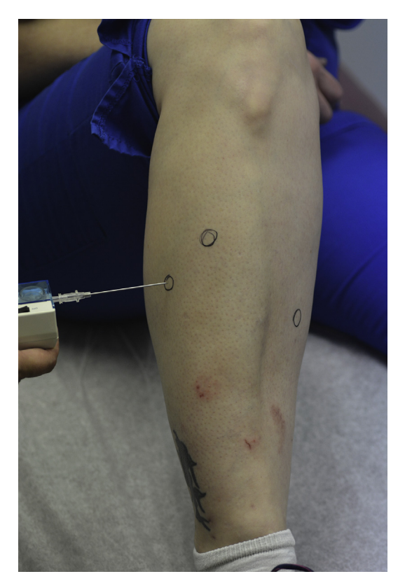
Fig. 4. Lateral compartment testing.

because the needle tract within the skin has already been established. Retest all the compartments in the same order as before and record all pressures.